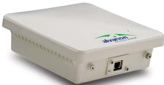
SU-EZ outdoor unit

Alvarion has always taken an active role in encouraging community satisfaction. BreezeACCESS EZ presents a step forward in overcoming the digital divide by providing an affordable solution that offers vast opportunities for enhanced communication, education, business, social development and improved quality of life.